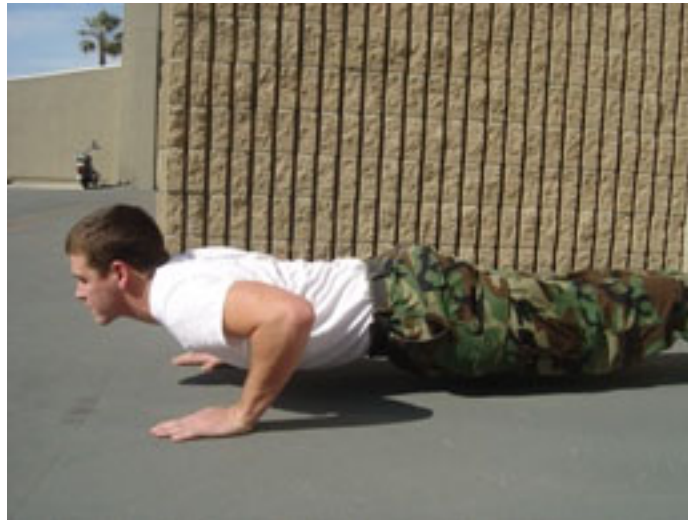
Figure 2: The “Down” position of the push-up - notice the arms form right angles and the back, buttocks, and legs are in line.