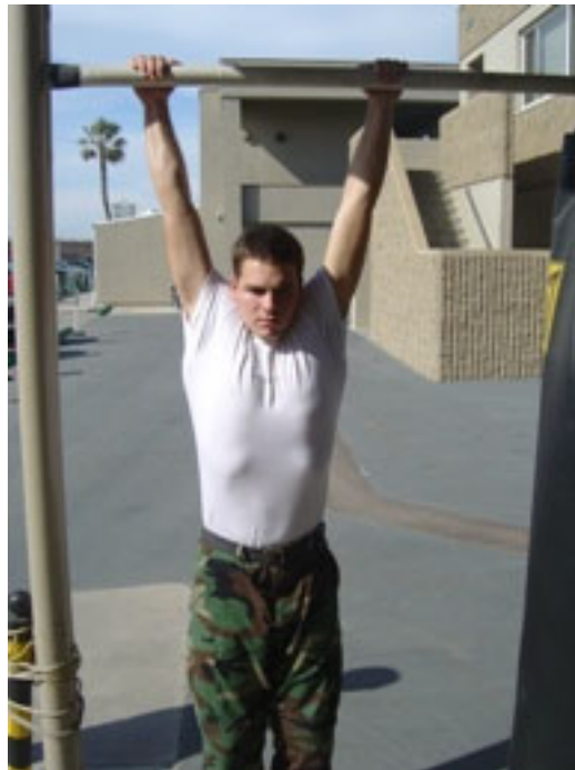
Figure 6: The "Down" position of the pull-up - notice the arms are fully extended.

(g) Receives more than two verbal warnings for executing incorrect procedures.