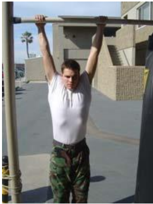
Figure 6: The "down" position of the pull-up. Notice that the arms are fully extended.

(2) The proctor will inform the candidate to begin the event. At that time, the candidate mounts the bar.