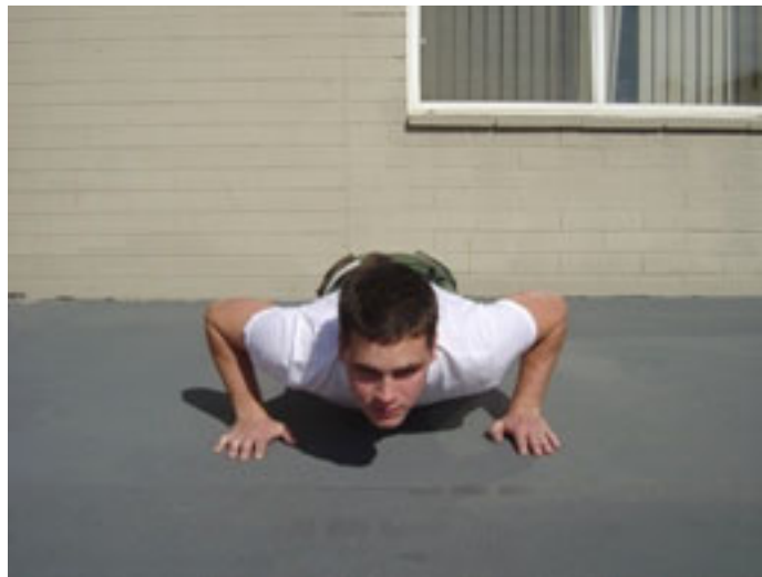
Figure 3: The “Down” position of the push-up.

(1) Push-ups must be performed on a firm or suitably padded, level surface.