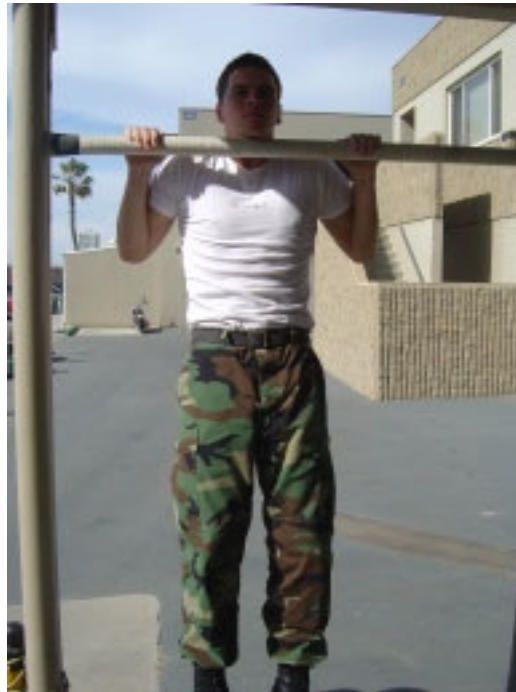
Figure 7: The "Up" position of the pull-up - notice the up position has been reached once the chin is even with the top of the bar.