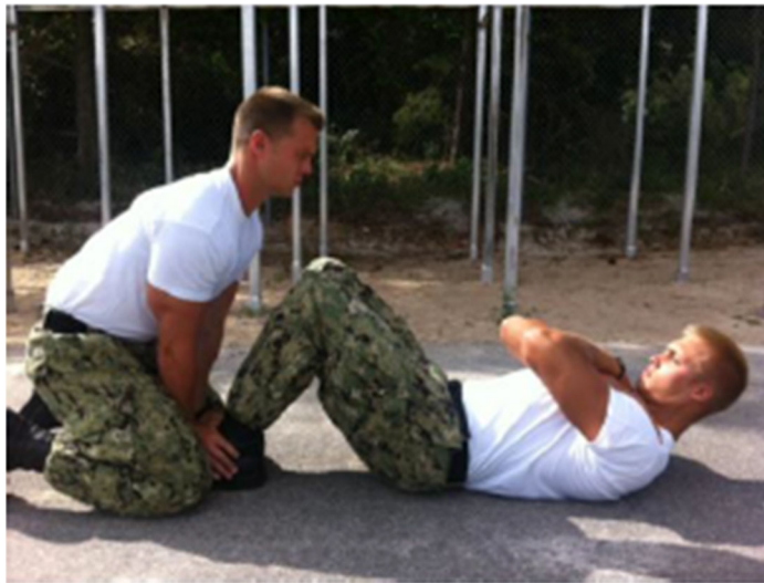
Figure 4: The "Down" position of the curl-up. Notice the partner holding the member's feet. Any other means of securing the member's feet is not authorized. Participant's buttocks remain on ground throughout curl-up, about 10 inches from heels.