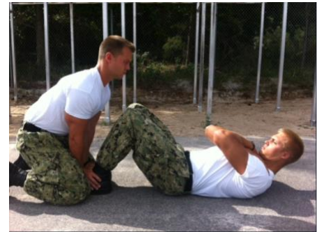
Figure 4: The "up" position of the curl-up. Notice that the elbows touch the thighs no more than 3 inches below the knees while the hands remain in contact with the shoulders or chest.

Figure 3: The "down" position of the curl-up. Notice the partner holding the member's feet. Any other means of securing the member's feet is not authorized. The candidate's buttocks and feet must remain flat on the ground throughout the curl-up