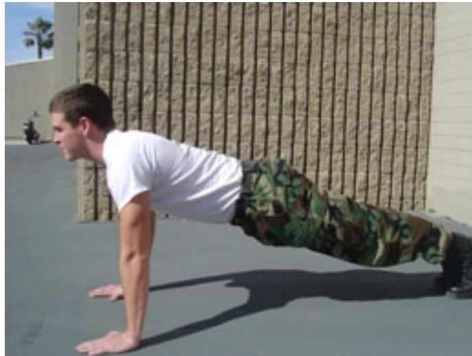
Figure 1: The "Up" position of the push-up - notice the arms are straight and the back, buttocks, and legs are in line.

(1) The push-up event will be conducted per reference (g) and these pictures will help testers evaluate whether a push-up is performed properly. Push-ups executed by the candidate using improper form should not be counted toward the candidate's total.