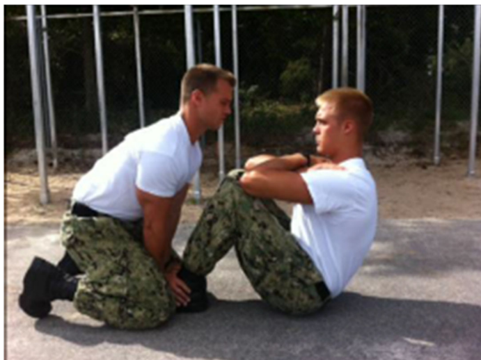
Figure 5: The "Up" position of the curl-up - notice elbows touch thighs no more than 3 inches below the knees while hands remain in contact with shoulders and chest.

(1) Event must be conducted with partner on a level surface, a blanket, mat, or other suitable padding.