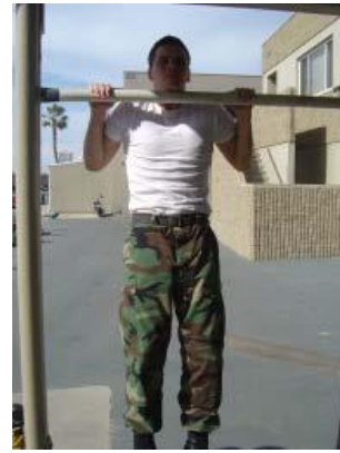
Figure 7: The "up" position of the pull-up. Notice that the chin is even with the top of the bar.